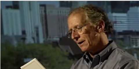
Why Does God Allow Satan to Live?